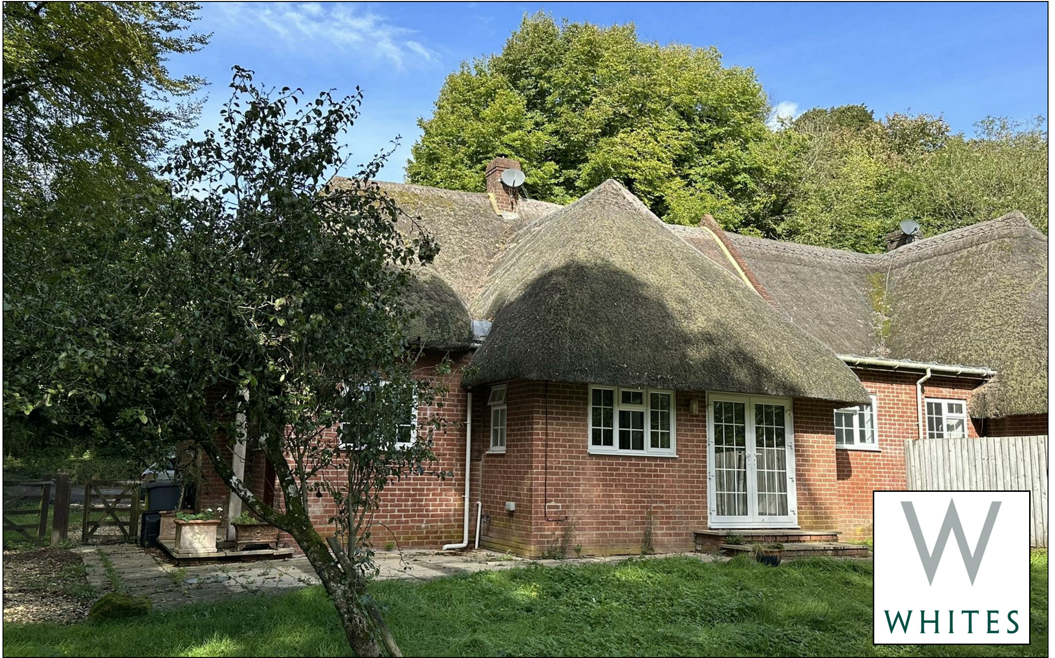
2 Vine Cottages, Handley Street, Ebbesbourne Wake, Salisbury, Wiltshire, SP5 5JG